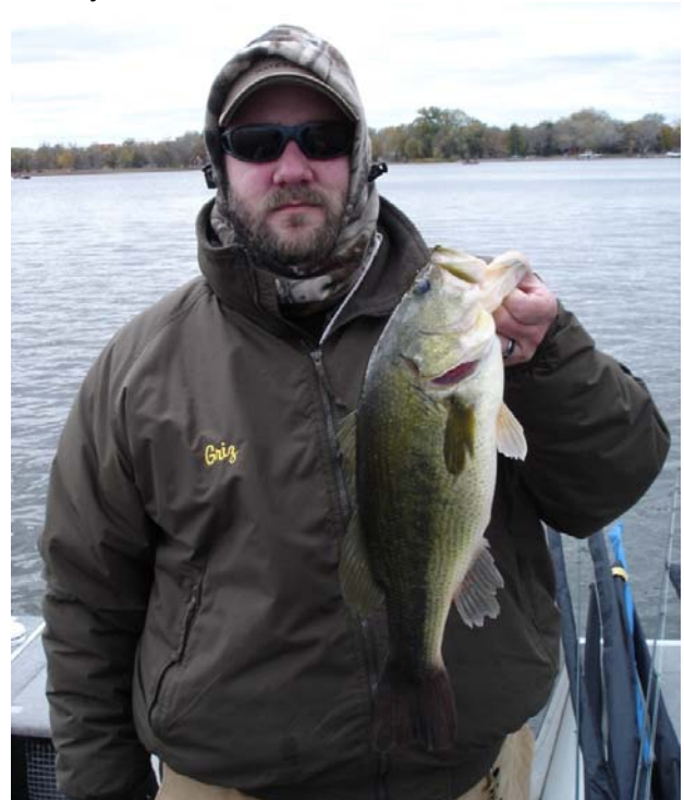
Even Griz was Bundled Up for the Nasty Weather

The bite was as cold as the weather with four teams getting skunked, and another three catching only one qualifying bass, out of the 13 teams fishing. Shorty described the day as being "extremely challenging" in other words. All together, there were 37 fish "weighed in" for the 27 guys fishing, which may be one of the lowest largemouth counts in tournament history.