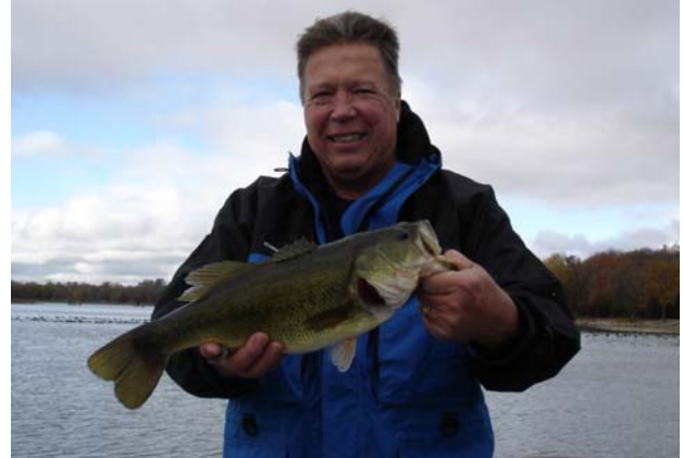
Chainsaw Landed a Nice Largemouth on the way to a Third-Place Finish

casting skill and accuracy, and the wind made it difficult to feel the action of lighter baits when a big wind-bow was put in your line. As a result of the miserable conditions, every team came in early before the 2:30 tournament finish, with some teams even leaving around noon.