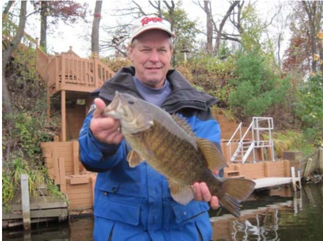
The Janitor with a 19" Smallie from the Rum River on October 23.