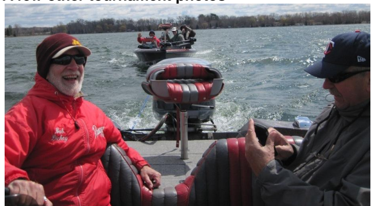
Our First Wienie Nominee