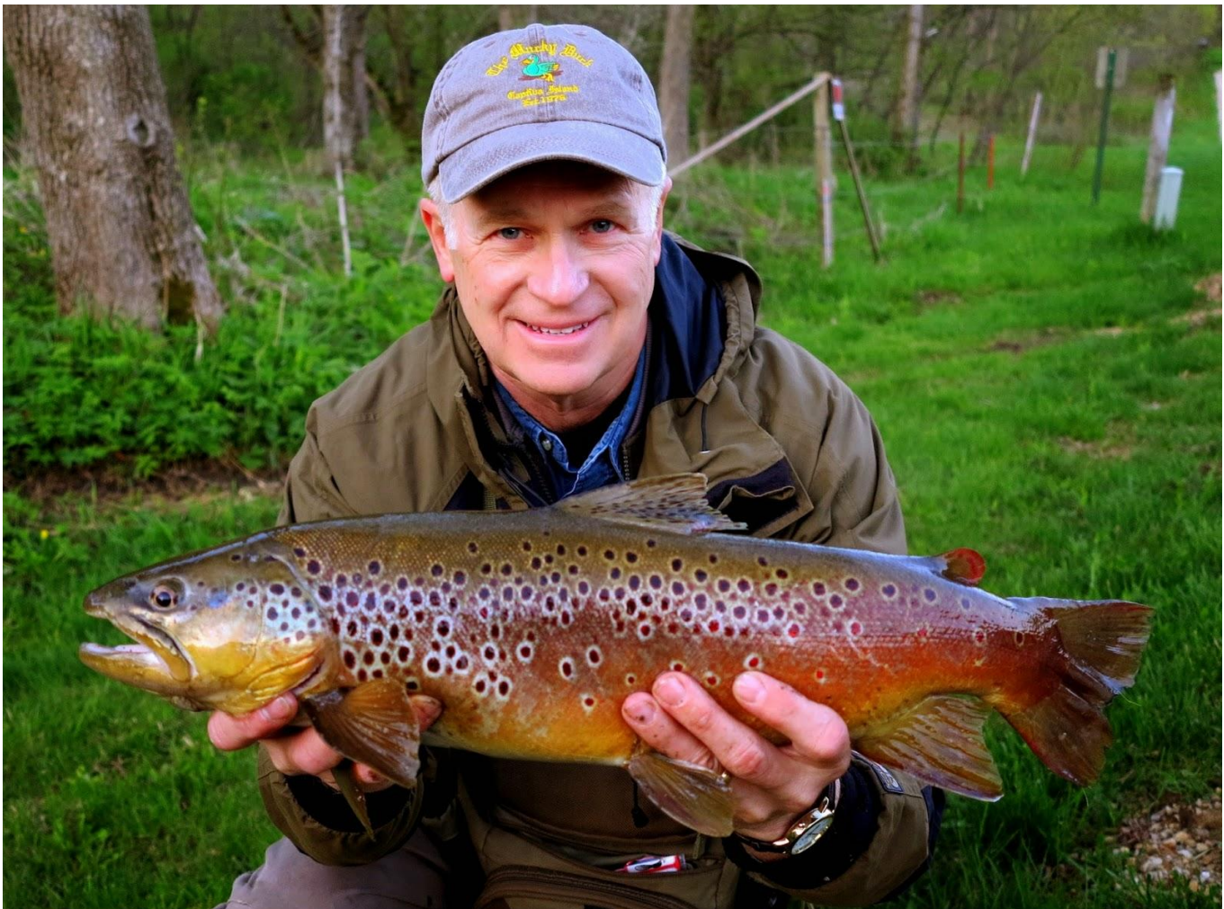
Shatner with fat (phat?) 22" Brown