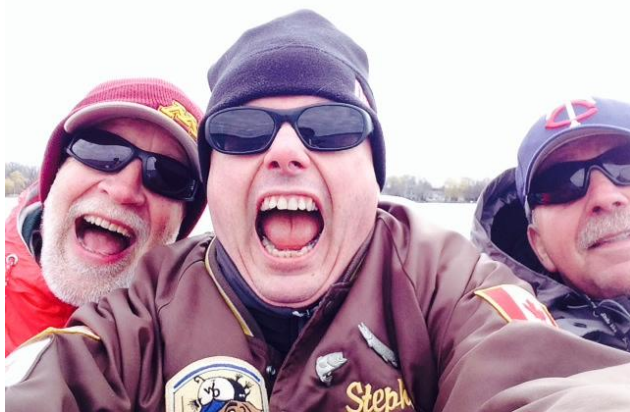
4th Place Selfie