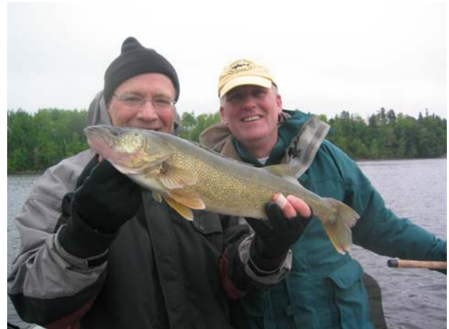
OF with a Leech-Caught 24

For another example, the second place team caught a total of 11 walleyes, all of which were from 18" to 24".