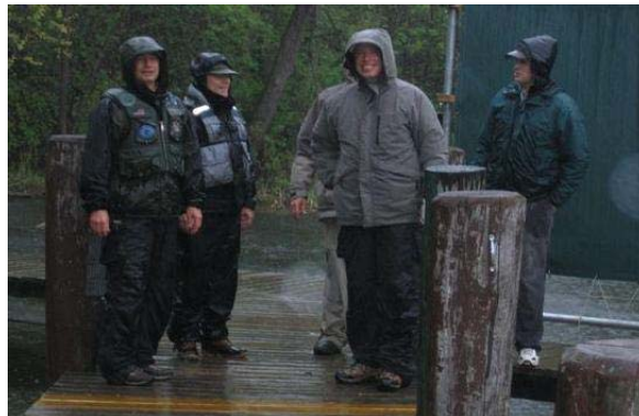
Dogs Wait Out the Storm on Dry Dock

The year's second tournament took the club to the nearly-annual tournament site of Lake Minnetonka, this time for crappies. True to form, the weather committee brought in a mid-day thunderstorm that caused the 26 dogs in attendance to scramble for cover for an hour, but otherwise it was a good day to be on the water.