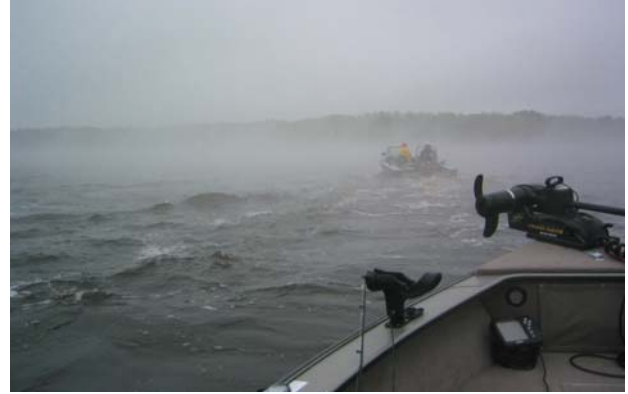
Dogs in the Mist

Club Tournament Number Four took place this last weekend on the St. Louis River in Duluth. This was the third time that the club has fished the river in a tournament, and although the fish were fewer this time, the average fish was about 3'-4" larger than when we fished the river two years ago.