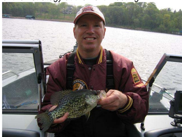
Mama's Boy with a 12.5"

Six teams 'filled out' their 15-fish cards for the day, but the team of Mama's Boy and Felix had a total weight that was more than a pound ahead of second place, and nearly a double of the sixth-place team with the same number of fish. The boys got their fish in Peavy Lake off of Brown's Bay, on the standard jig-and-minnow, and also a jig and twister. Their limit included a tournament-largest pair of 12.5 inchers caught by each guy, which count twice as heavy as a standard 10-inch crappie. The winning team will spill their guts with the details of their strategy at the next meeting.