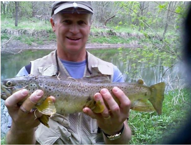
19.5" in the Picture, but 20+ in Real Life