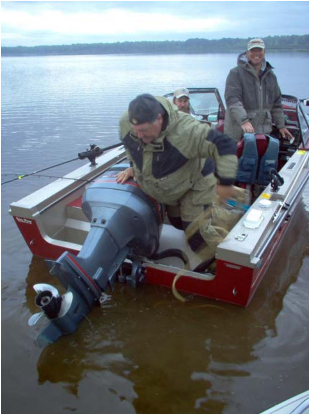
Six Lines Can Cause Calamitous Clusters

On the water, more lines proved to be better odds for fish, when a 3-man team could have a total of 6 lines dragging the bottom for walleyes. After the first day of fishing, the three 3-man teams were also 1-3 in the standings, but 'The Incident' possibly cut into one of the 3-man team's success on day two. More on this event is detailed below. In all, 59 counting walleyes were caught in the tournament, along with fish of other species, including smallmouth, muskies, and the ruffies and gobies, along with a selection of mollusks and arthropods. The walleyes did run bigger than in previous years, where to years ago, the biggest fish were 20"-21", this year they were 23"-25".