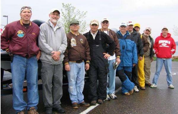
Crappie Contest Winners