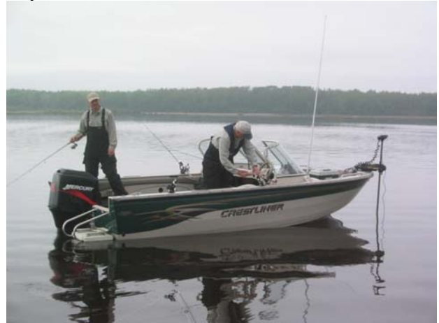
Easier Boat Control on Day 2

In typical Duluth fashion, the weather was cold, windy, foggy and rainy the first day, but overcast and calm the second day. The fishing remained slow but steady on both days, despite the unsettled weather conditions. Some day, the Weather Committee will get it right, hopefully in time for our upcoming two-day bass tournament.