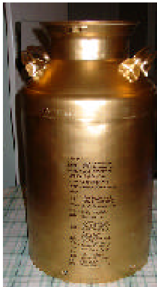
The new trophy for the most muskies caught during the LOTW trip – The Milk Can.

Musky University – will be at LOTW two weeks prior to our trip. They typically stay at Monument Bay Lodge.