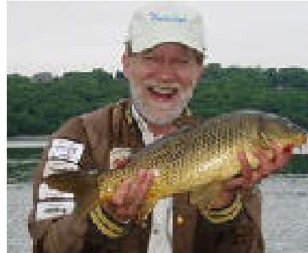
Bugle-Mouth Walleyes Count Double

For most of us, the highlight of the tournament was watching the big jackhammer knock off chunks of concrete from the 94 bridge, and having them crash into the barge or water below. It was such a peaceful racket that it lulled Chainsaw to sleep after lunch. At least now we can put the live bait aside for a bit.