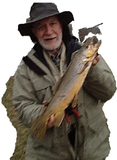
FD 18.15" Big Fish of the Day with a less than professional blanking out of the background

After two of the nicest days of the spring with temperatures in the 60s, Saturday greeted the