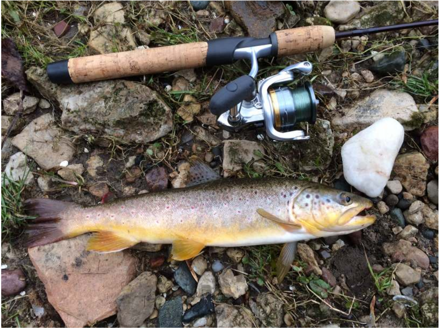
16" Brown and Rod by Banana Boy