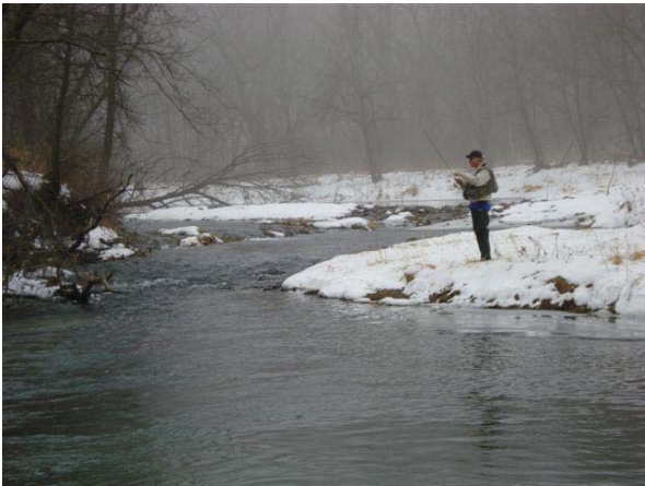
OF Plies the Winter Waters

good for the most part, with still good structure and what seemed to be an OK population of fish as well. The highlights of the day were a 17" brown caught by FD on a Panther Martin, a 15" caught by Felix, and more than 12 fish caught by Buick. Nasty, OF, and Shatner were also part of the crew and all caught fish. The boys were pleased to report a successful outing with no broken bones or hooked heads. It appears that the trout in the Whitewater survived last year's flood in good enough shape to be worth making the trip, so if you see a warm stretch coming, give a Dog a call and check it out!